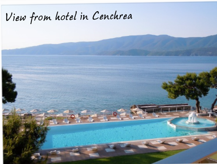
View from hotel in Cenchrea

there we experienced a boat ride on the Corinth canal, originally started by the Emperor Nero. A trip to ancient Corinth, at one time the greatest military city in