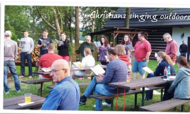
Christians singing outdoors

encouragement and helps boost morale, bringing together a group much larger than the local assembly.