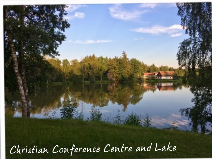
Christian Conference Centre and Lake

My latest excursion into these parts took me to the Czech Republic where once each year is held the Central European Retreat. For a number of years this has taken place in a most pleasant rural setting at Dlouhý-Slavíkov, about 90 miles east of Prague. Arriving by train a couple of days early enabled me to sample some of the delights of the Bohemian capital, before heading east to the retreat.