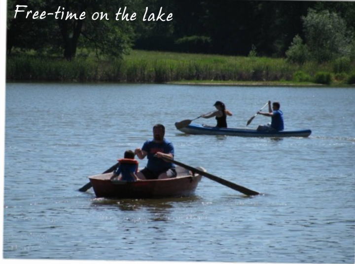
Free-time on the lake

If one ever goes to such an event with any sort of expectations, then those I had were far exceeded. It really was a pleasure to be among such lovely people and to share in what was a truly joyful family spirit, demonstrated by the common love among these fellow believers. The next retreat will be held from 21 st to 24 th June 2018. One never knows...I just may go back!