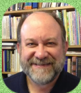
Production editor: Jon Galloway www.churchesofchrist.co.uk https://www.facebook.com/christianworkeruk Deadline: 21 st of each month

Summer is here! As I have been putting this month's magazine together, temperatures in Scotland have soared to a sweltering 30 C (85 F). After such a harsh winter it is wonderful to actually be getting summer!