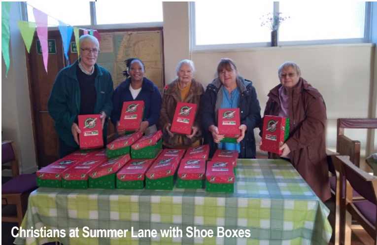
Christians at Summer Lane with Shoe Boxes