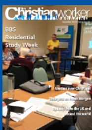
Front cover and above: BBS Residential Study Week at Bassenfell Manor