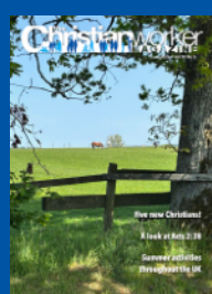
Front cover and above: springtime in Scotland