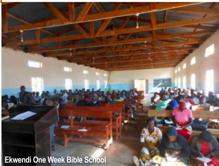
Ekwendi One Week Bible School

teachers at our school are our own local preachers trained by the second generation of missionaries and the participants are picked from the local congregations along with their leaders (elders). So it's hands-on and they value that they can also contribute with food and materials, allowing them to understand the importance of being involved. I make an appeal to cover the shortfall as our country economy and the Christians come from families of low income of less than a dollar or two per day.