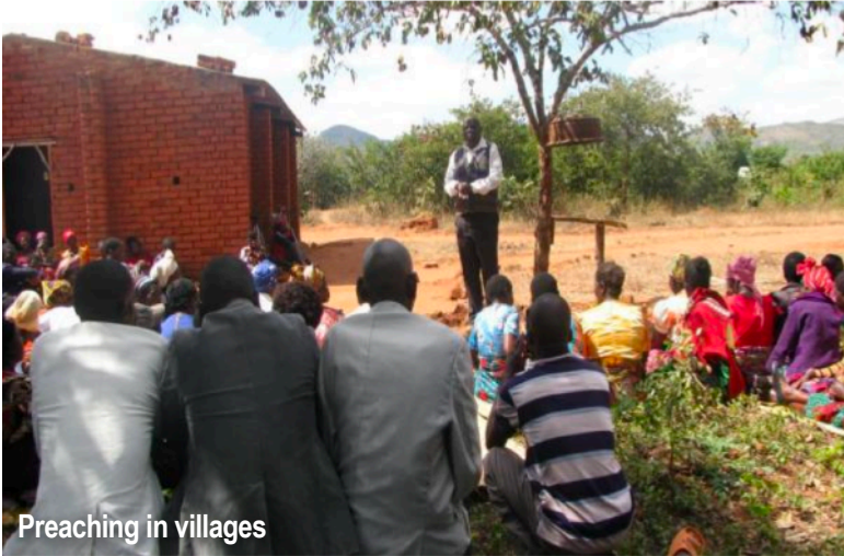
Preaching in villages

Outreach programme – Currently there are 38 congregations and each one expects me to visit at least once or twice a year but due to health problems and lack of support this is not possible – I try to take opportunities when there are village gospel meetings. Most congregations cannot afford a full-time preacher, which brings its own problems.