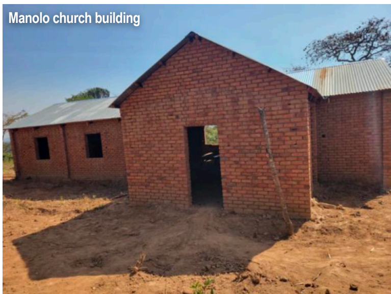
Manolo church building

My thanks to you all for the help to have the Manolo church building now operational. The other remaining work can be done as we have time now that we have fixed the door – next week we hope to fix the windows and start