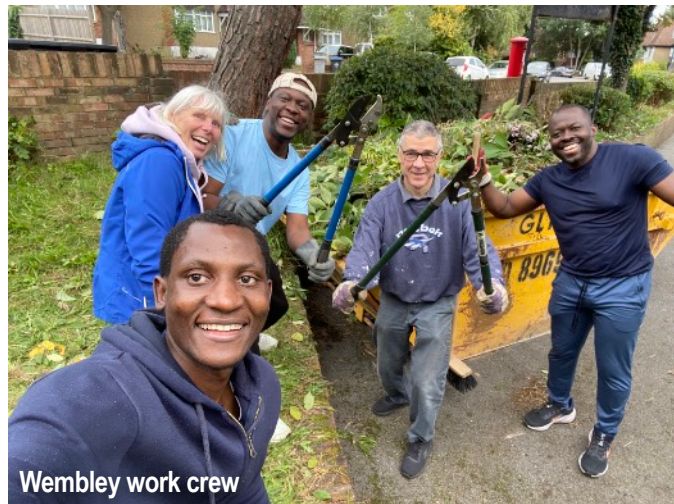
Wembley work crew

grounds looked much better. We are thankful to all who turned up to help.