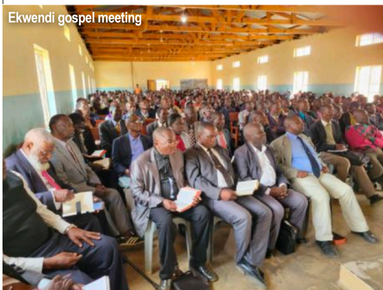
Ekwendi gospel meeting

We had a gospel meeting in Ekwendi at the end of the Bible School. Christians started arriving before the school finished and we ended up with 723 in attendance on Sunday with four who were immersed and seven restored.