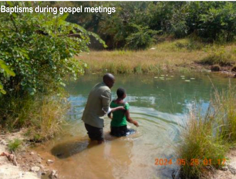
Baptisms during gospel meetings

The Ekwendeni one week school tries to train local Christians who are able to read and write so that congregations can worship on Sunday and the Christians remain faithful. Most of the